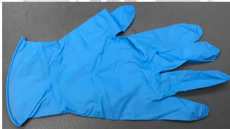
Photo : Disposable Nitrile Glove, Size M