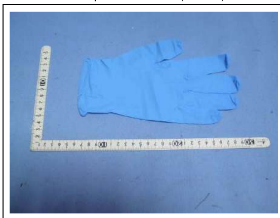
Sample as received (Size M)

SGS authenticate the photo on original report only