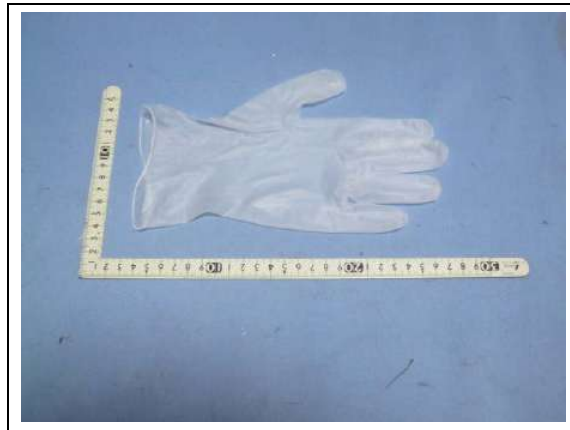
Sample as received (Size M)

SGS authenticate the photo on original report only